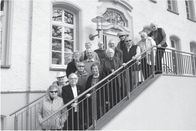
Child Survivors at a meeting in Petershagen in 2018