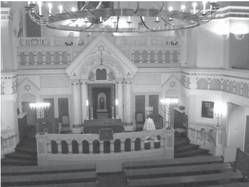
Liberal Synagogue, Berlin, Pestalozzistr. 12–14