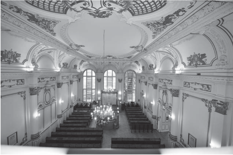
Orthodox Synagogue, Berlin, Joachimsthaler Str. 13